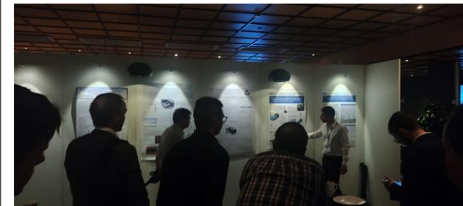
Fig 2. Poster Presentation section.